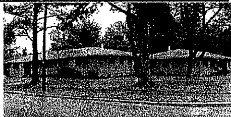
607 Ralph Drive Raleigh, NC 27610

607 Ralph Drive is a one story brick apartment building with beige trim. If you are facing the house, the numbers "607" appear in black to the left of the front door. Any and all out buildings, and any and all vehicles parked within the curtilage.