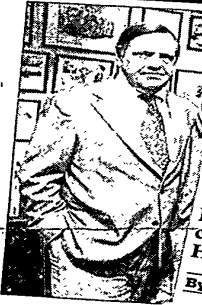
Sen. Jesse Helms

But Jesse Helms has always been tough. The first campaign he participated in was in 1954, when he ran for the House of Representatives against Frank Graham, the incumbent. Helms lost, but he gained a reputation for being a shrewd operator. In the final hours of the campaign, the state was flooded with pamphlets suggesting Graham was pro-Soviet. Helms claims he didn't publish these pamphlets, but others insist he was the chief architect of Smith's strategy. In any case, Smith won and brought Helms to the attention of the state's conservative association and then, for 12 years, to the Senate in 1972, the year the conservative editorial voice of Raleigh was founded.